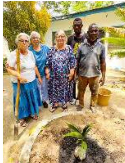
DMJ Sisters Planting Coconut Tree

lives over the years, and we are confident that the benefits of their efforts will continue to yield good results. We will work hard to maintain the DMJ charism and continue caring for the people 'for whom society says there is no place'. We are sorry to see them go and wish them well in their future ministries.