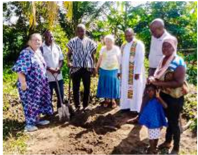
Sod Cutting Ceremony, Enyinnda

A sod-cutting ceremony marked the beginning of an income-generating project with store rental and accommodation. The primary objective is to assist PPRC in generating income to work towards long-term independence from donor funding. The project will also help stop the encroachment of land at Enyinndakurom. We have £20,000 from the Hayward Legacy, and we need to secure special funding through a capital budget proposal to undertake this project.