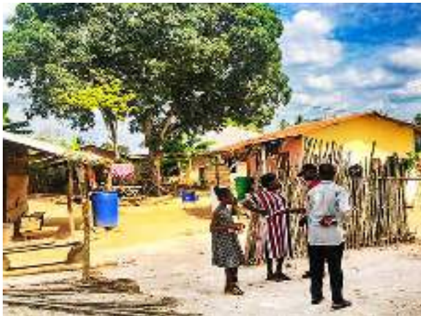
Visit to Kojo's Village