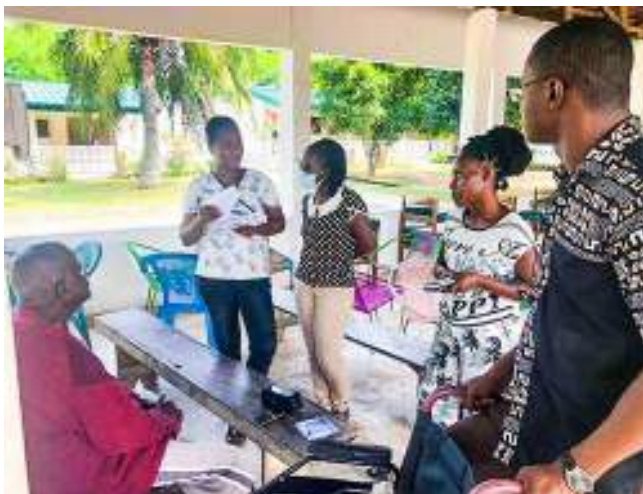
EPC Visit to St. Clare’s