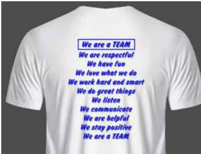
PPRC Staff T-Shirt

Recently, six PPRC staff members passed their driving test and were given their driving licences.