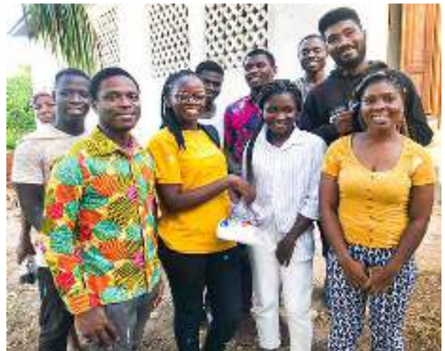
New Winneba Students