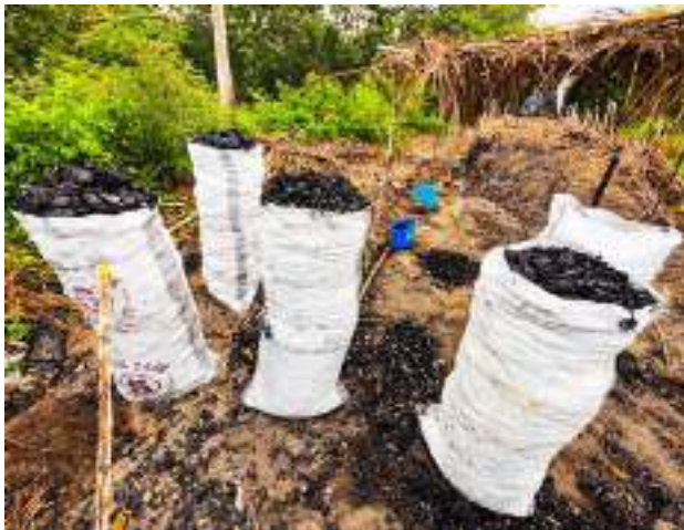
Charcoal – Ready for Sale

strong. We have generated >79,000 units (KWh), and our electricity costs are down >90%.