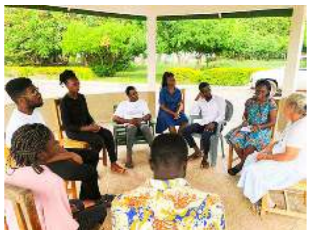
New Winneba Students – Introductions