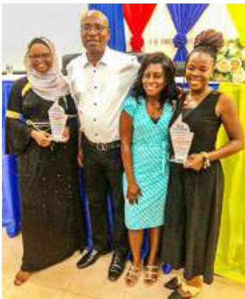
UCC Mental Health Award