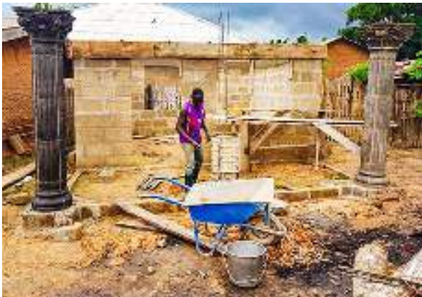
Work in Progress - Kojo's Family Home