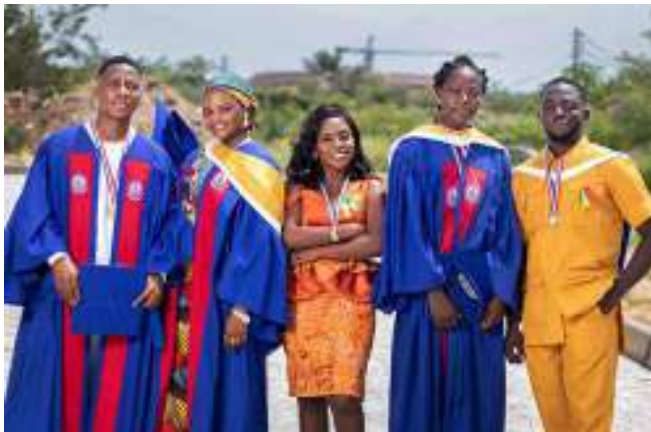
Five NS/PPRC Winneba Graduates

We welcomed 22 USA students and faculty members in June. The purpose of their visit was to provide them with international service-learning and authentic cultural immersion experiences by interacting with staff and clients at PPRC.