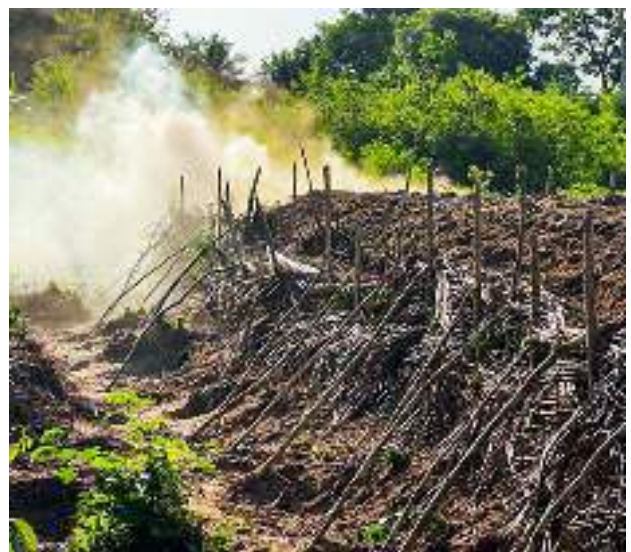
Charcoal Pile Smoldering

We recently took measures to reduce the use of plastic bags throughout the campus. Our access roads are deplorable due to the recent heavy rains and have become mostly pools and potholes. We urgently need to do something about this.