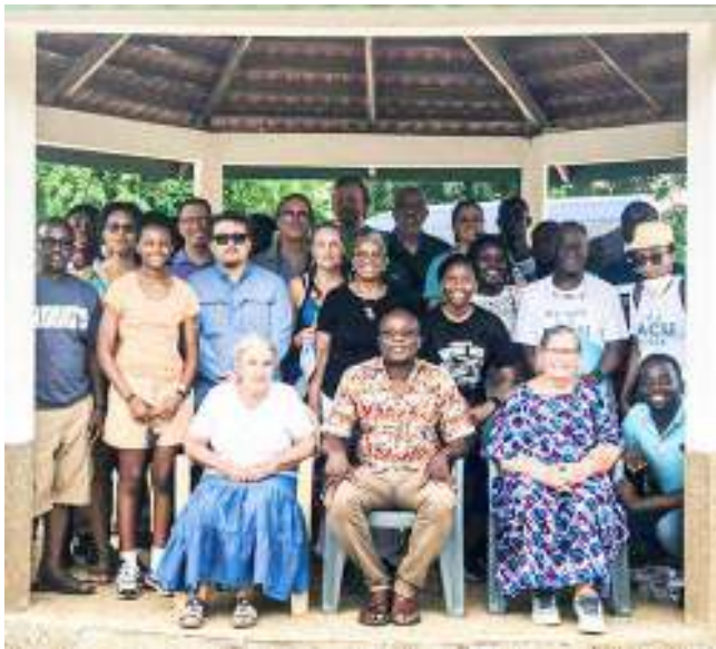
Episcopal Diocese of Atlanta Visit