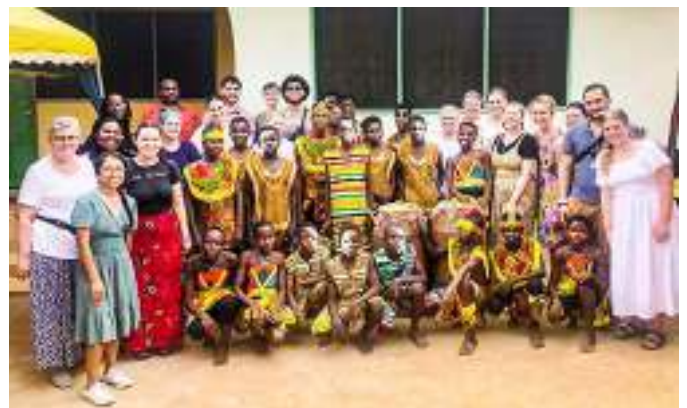
Cultural Immersion - USA Visitors