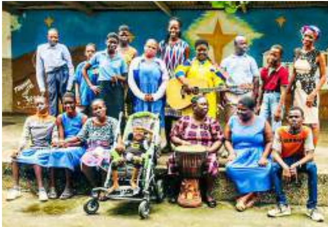
Greetings from St. Elizabeth's

We are seeking financial support to start this project; a medium-sized baking oven and related equipment are among the essential items required.