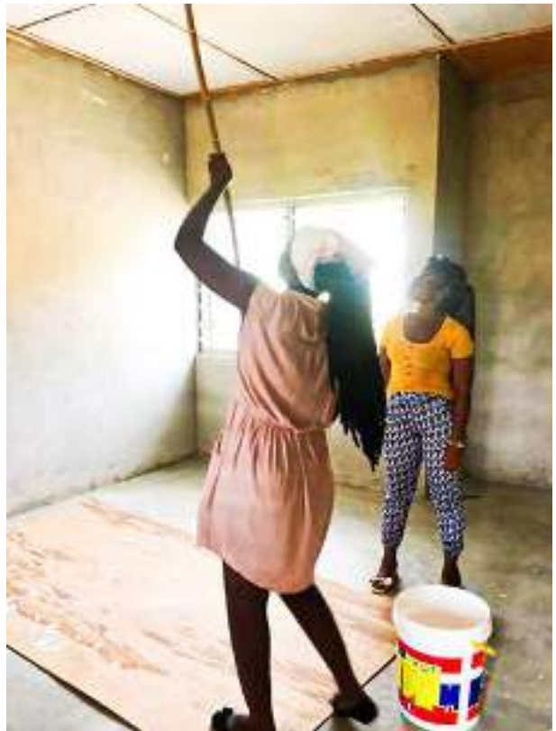
Student Volunteers Painting Twins' House