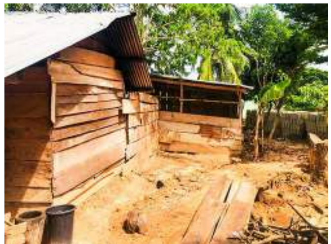
Kojo’s Home / Village

We are supporting 26 clients through our outreach services: 19 children directly and seven older adults living independently. Our top priority clients are leprosy-related families, vulnerable families trying to stay together, and disadvantaged single-parent families. We strive to achieve the best possible outcome for each client within the constraints of our available resources. The critical difference between our outreach services and our former residential approach is that now, our