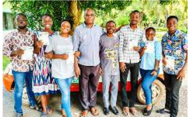
PPRC Staff – New Driving Licences

Recently, six PPRC staff members passed their driving test and were given their driving licences.