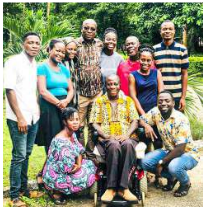
Greetings from the PPRC Team