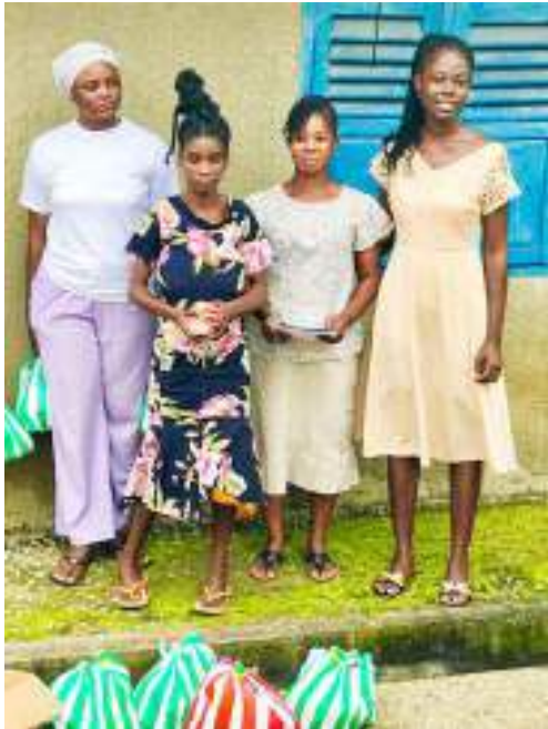
Enyinnda Outreach Visit

Our five current NS employees recently graduated from their degree courses at Winneba University. This was a proud day for everyone. They've been taking on lots of responsibilities and producing great results. We are so blessed to have these young people with us, and we'd have struggled recently without their help.