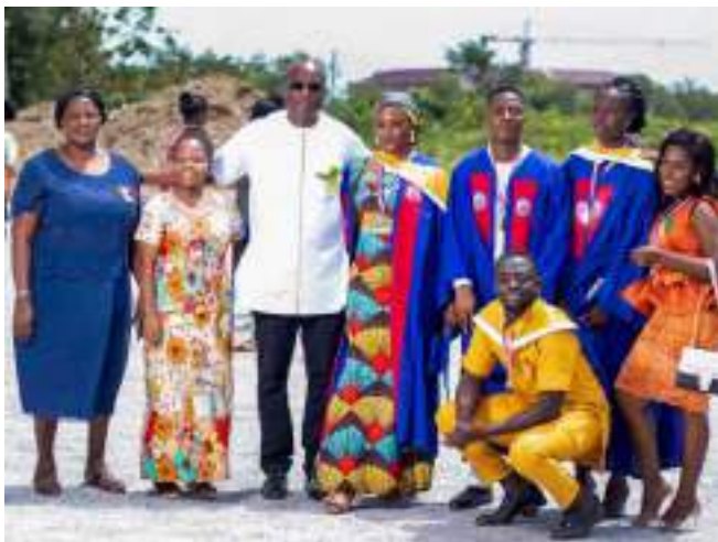
Graduation Day Winneba