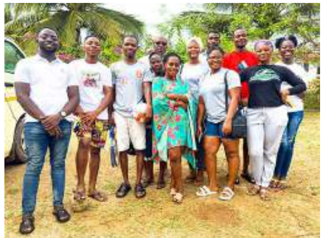
Interns & National Service (NS) Staff

A sod-cutting ceremony marked the beginning of an income-generating project with store rental and accommodation. The primary objective is to assist PPRC in generating income to work towards long-term independence from donor funding. The project will also help stop the encroachment of land at Enyinndakurom. We have £20,000 from the Hayward Legacy, and we need to secure special funding through a capital budget proposal to undertake this project.