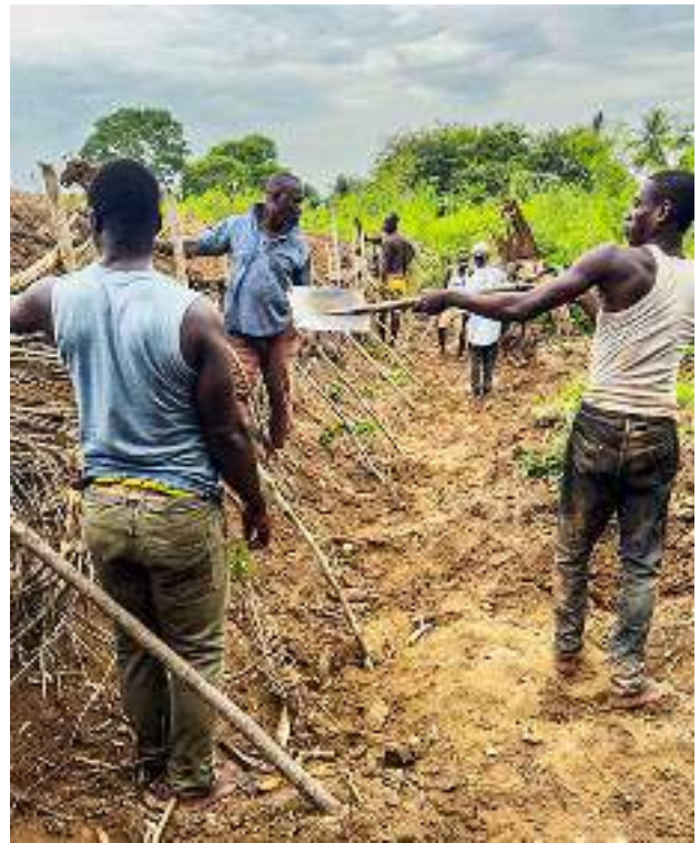
Preparing the Charcoal Pile