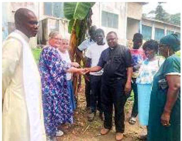
Twins' New House – Handover Ceremony

PPRC staff have been doing house-to-house visits with the families in Enyinndakurom. The team believes this