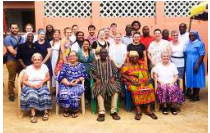
Service-Learning - USA Visitors

We welcomed 22 USA students and faculty members in June. The purpose of their visit was to provide them with international service-learning and authentic cultural immersion experiences by interacting with staff and clients at PPRC.