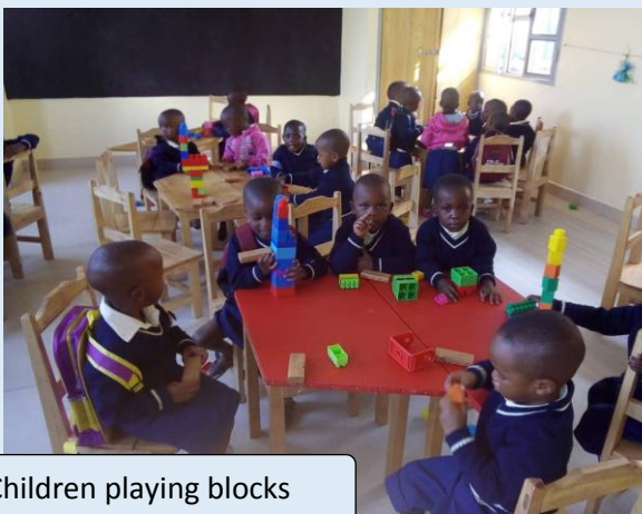
Children playing blocks