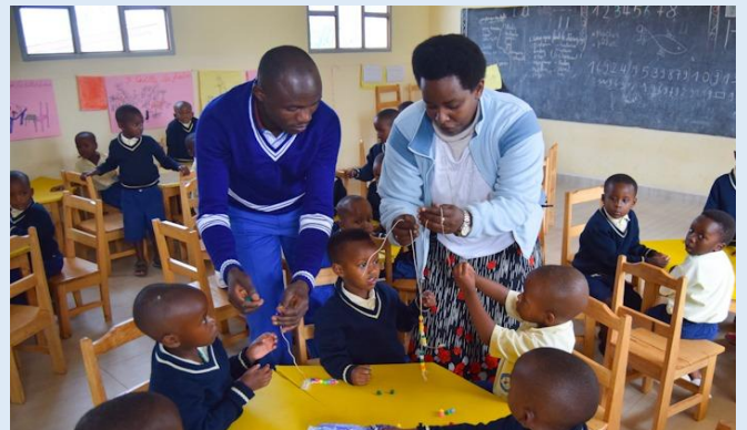
Head mistress helping the children to be creative