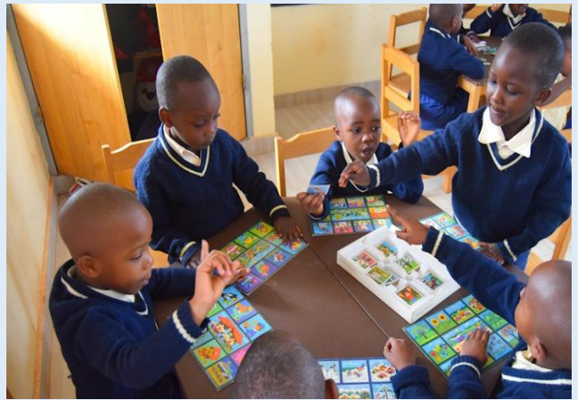
Teachers helping pupils to think critically