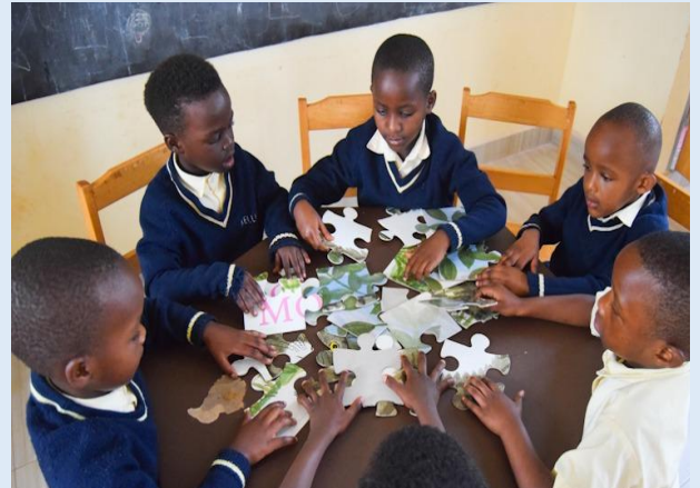
Children making playing puzzle