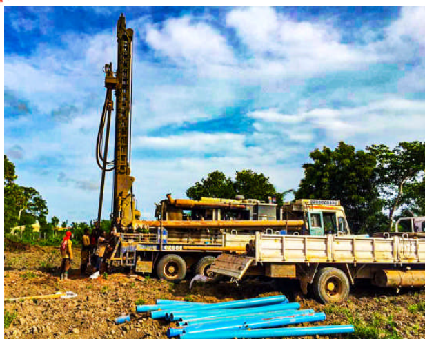
Drilling the Borehole