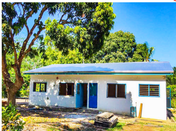
New roof installed