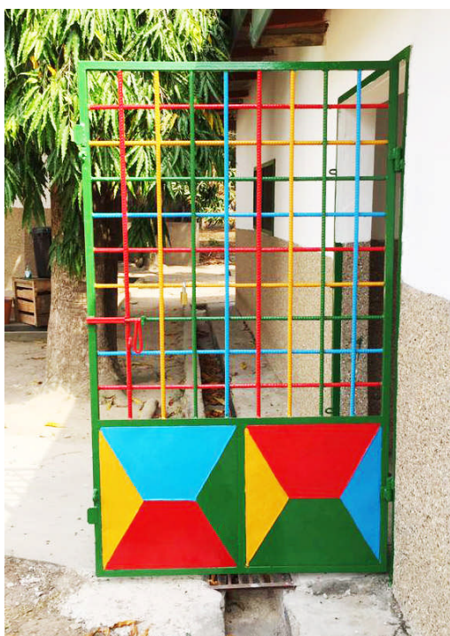
St. Elizabeth's Freshly re-painted Gate