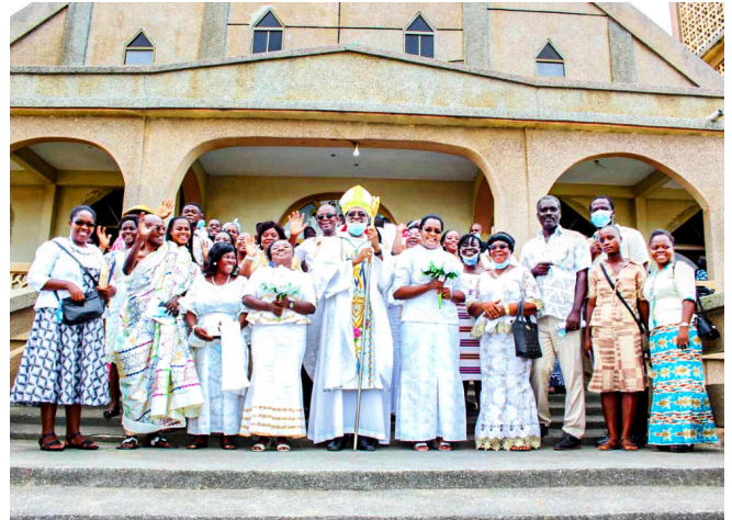
After the Ceremony - with the Archbishop – outside Moree Church