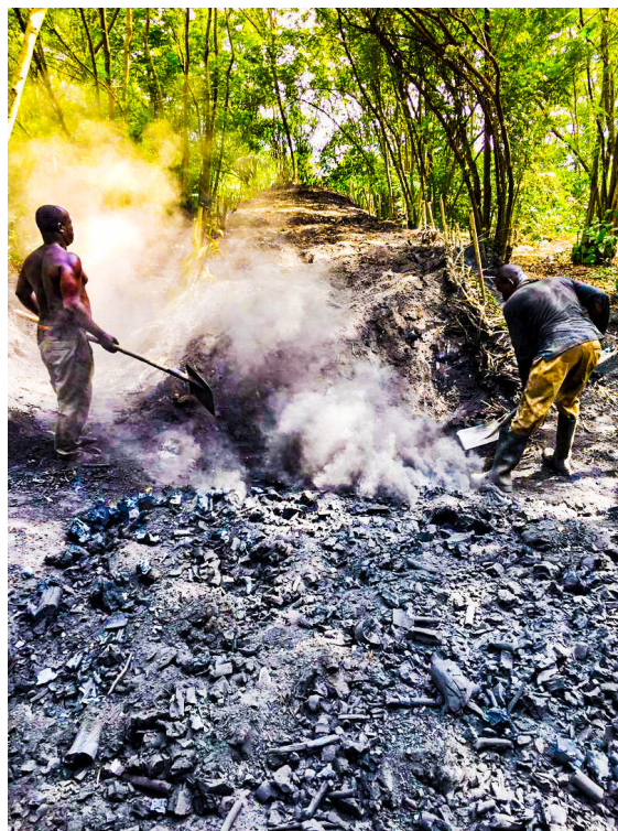
Charcoal production in Anoto