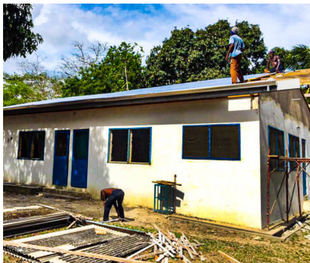
Re-roofing – work-in-progress