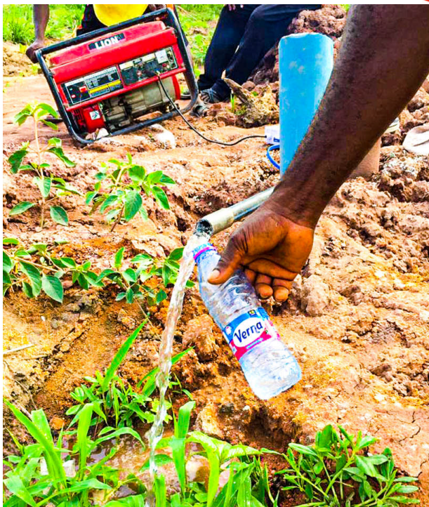
Sampling the new Borehole Water