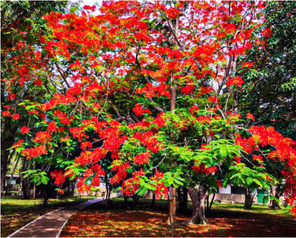
Flame Tree in bloom in Ahotokurom