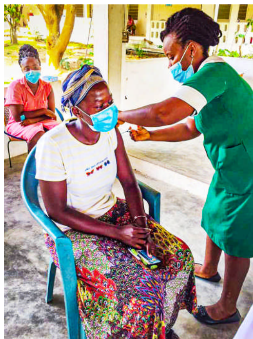
Vaccinations in St. Clare's