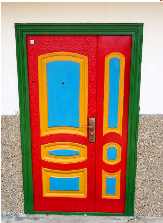
St. Elizabeth's Freshly re-painted Door