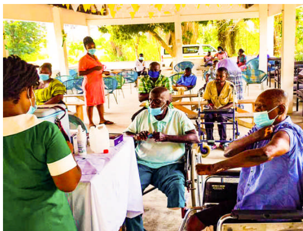
Vaccination Centre in the Pavilion